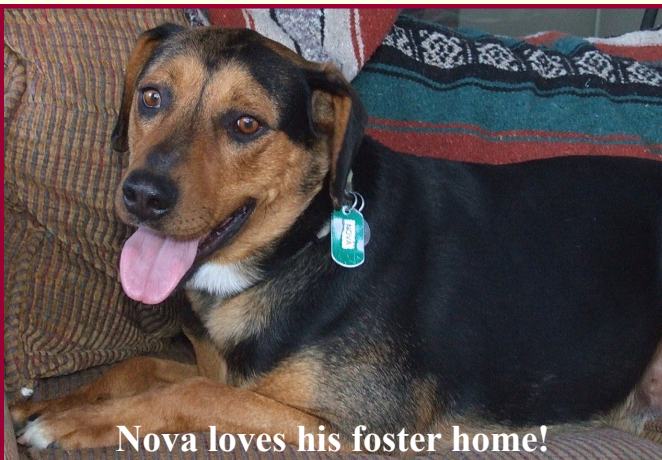
Nova loves his foster home!