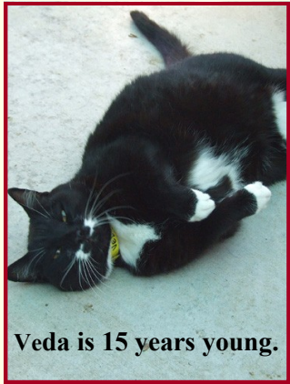
Veda is 15 years young.

Kittens will always be popular, and most have no trouble attracting admirers. But for the abandoned, forgotten, and heartbroken adult cats, you just might be their last chance to have the love and warmth of a home where they can live out their years in comfort. When properly cared for, cats often live well into their late teens, and sometimes into their early twenties. Typically, they will remain active and even playful