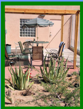
Visitor and Volunteer Patio