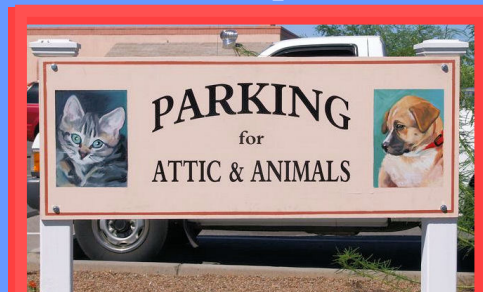
New Parking Lot Sign

Our TALGV Maintenance Crew At Work for People and Pets