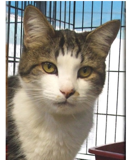
Sweeney was found abandoned.

Our community has so many more animals in need. If TALGV can't take them in, what will happen to them?