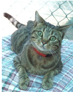
Bubba is the lone survivor of an abandoned litter.