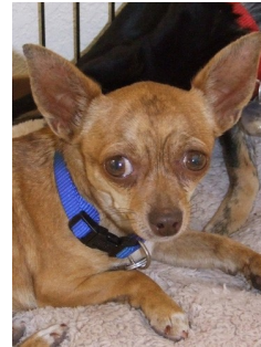
Madge was found on the side of the road.