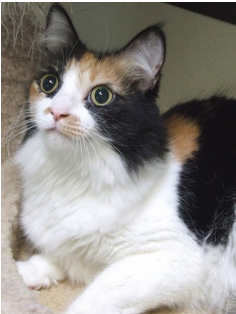
Meow arrived with poor eyesight and needs a quiet home.