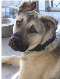
Luca was found alone in the desert.