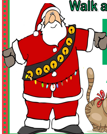
Photo shoot with Santa & your pets Walk away with your photo

Wednesday, Dec. 11 th , 9 am to 1 pm Farmers' Market @ Green Valley Village Mall Courtyard by the large Christmas Tree