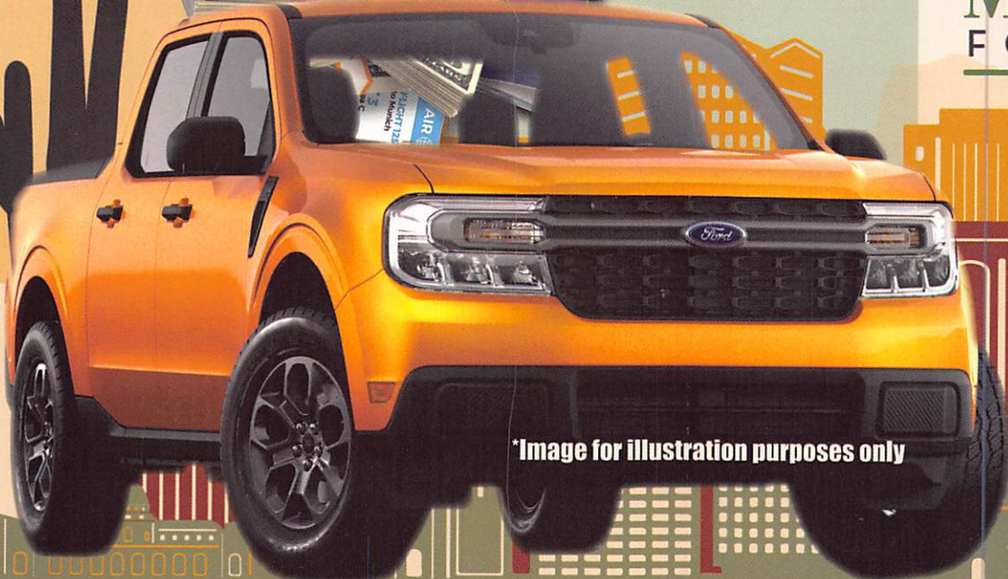
*Image for illustration purposes only

THE JIM CLICK MILLIONS FOR TUCSON RAFFLE